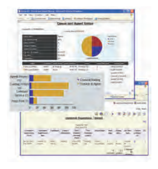
Figure 2; Base business decisions on measurable results – not just activity. Gain actionable insights into customer and agent experience in real time through comprehensive reporting and analytics.

Customer Service Editions from Avaya deliver on your terms because they enable you to achieve your unique business goals. Built on proven technology, adherence to best practices, and over 20-years of experience, Customer Service Editions are helping businesses worldwide meet their communication needs.